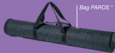
Bag PAROS *

* All our roller banner stand come with a carry suitcase or bag.