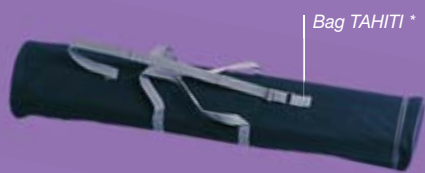
Bag TAHITI *