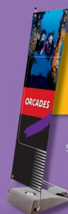
Bag ORCADES *